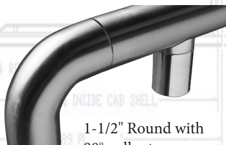
1-1/2" Round with 90° wall return.