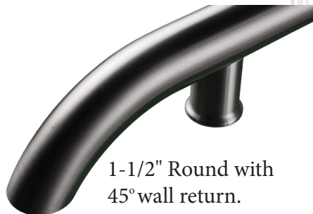
1-1/2" Round with 45° wall return.

Handrails and bumper rails are an integral part of the design and aesthetics of your elevator. While providing passenger safety they also provide protection for your elevator interior. Finishes include brushed and rigidized and are available in stainless steel and bronze finish.