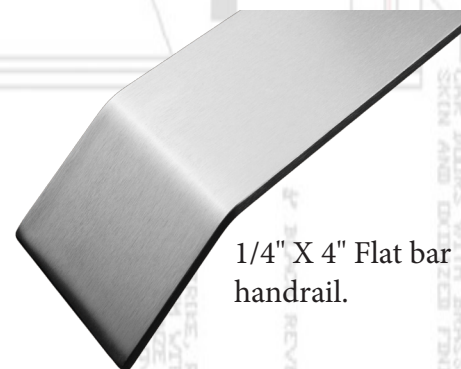
1/4" X 4" Flat bar handrail.