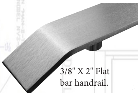
3/8" X 2" Flat bar handrail.