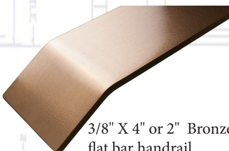
3/8" X 4" or 2" Bronze flat bar handrail.