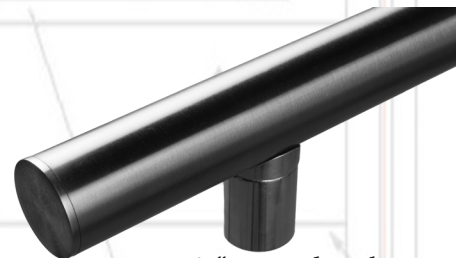
1-1/2" Round without wall return.