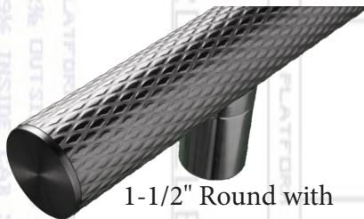
1-1/2" Round with Rigidized® finish. Available in stainless steel only.