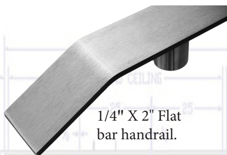
1/4" X 2" Flat bar handrail.